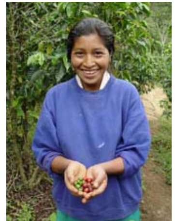
Honduran woman with coffee beans