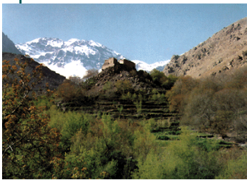
Moroccan casbah among the Atlas Mtns